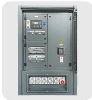
Fitted with ComAp controller