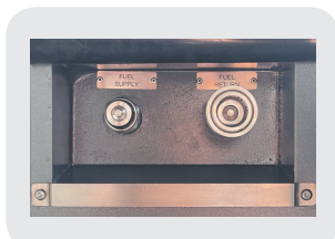
Fitted with 3 way fuel system for extended run times