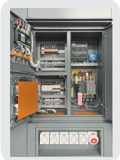
Built to meet all ISO & AS Standards