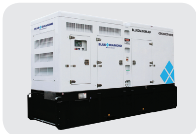
Cummins powered and rated @ 60°

❖ Outlet Configurations: At Blue Diamond Machinery, we can install outlets to meet the clients' needs and have access to all leading brands.