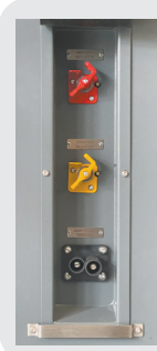
Fitted with isolators & Jump Start Terminal